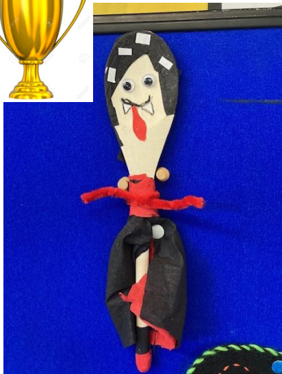
Casey (Poland Class)