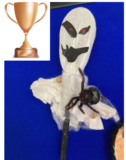
Oliver (Australia Class)