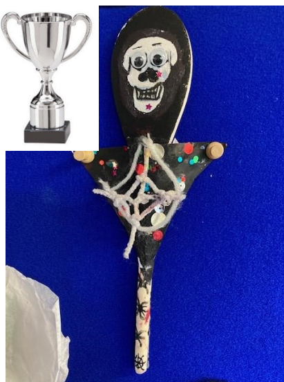
Amira (China Class)